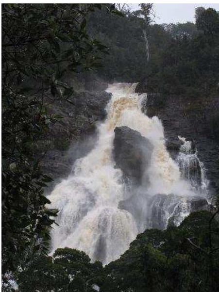
St. Columba Falls, Tasmania